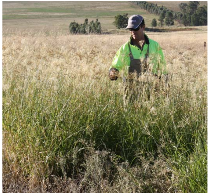
Competitive pasture trials, Wellington NSW

Cattle and sheep will graze on silverleaf nightshade, particularly in the absence of more desirable pasture species. Silverleaf nightshade contains alkaloid glycosides, which may be hydrolyzed to form toxins that cause diarrhoea and nervous disorders, however no livestock deaths have been reported in Australia.