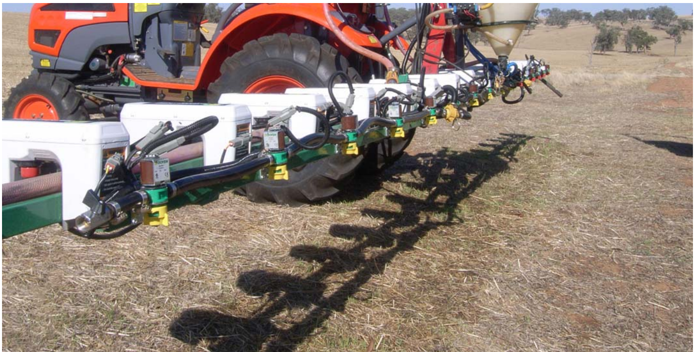
Weed activated spray boom

Wick wipers require the weeds to be taller than the pasture to work effectively, so may not be suitable for all situations. WeedSeeker booms operate by solenoids switching on whenever something green passes underneath the nozzle, therefore are best suited to fallow situations. This provides savings in time and money, as well as allowing larger areas to be treated when spray conditions are optimal.