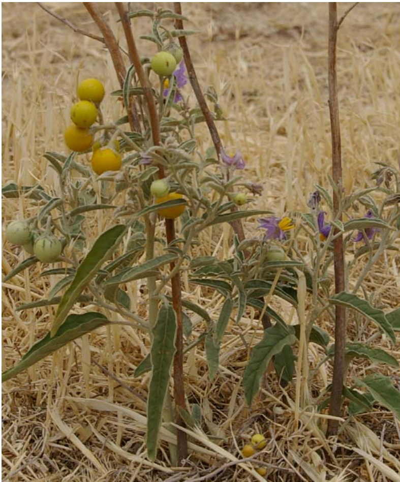
Silverleaf nightshade

Ensure all livestock do not have any berries attached to their coat or feet. If there is a chance the livestock have been grazing where berries were present, or consumed fodder containing berries, quarantine stock in a small area for 14 days to allow any ingested seed to be excreted.