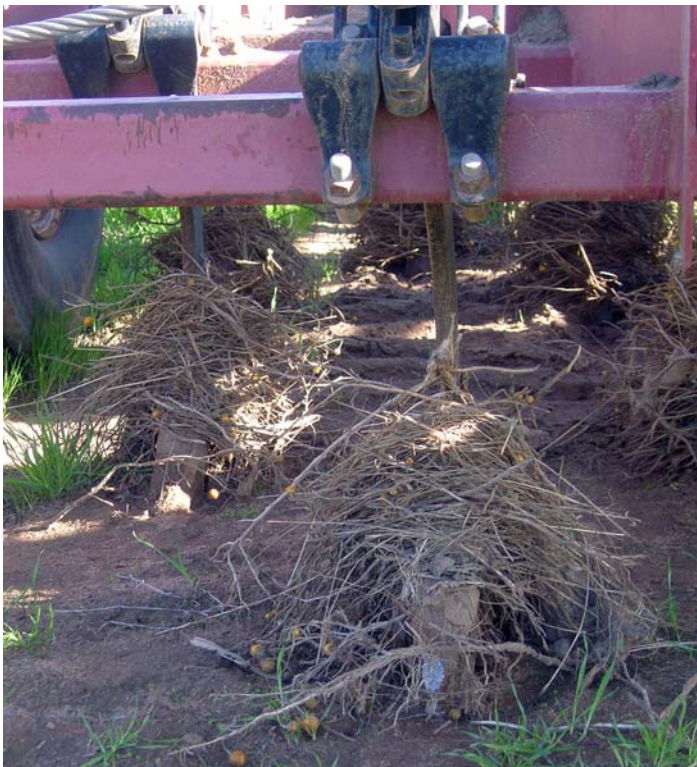
Silverleaf nightshade movement by cultivation – photo Rex Stanton

Several Eucalypt species have been identified that suppress silverleaf nightshade. In appropriate areas, tree belts could be established and used for long term control of small infestations. As well as providing natural control of weeds, tree belts also provide refuge for native fauna and shelter for livestock.